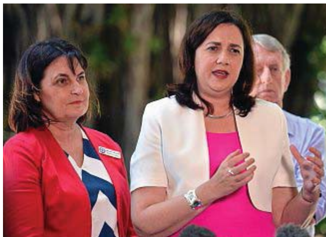
Premier Anastacia Palaszczuk hopes the mine will get the final go-ahead this week.