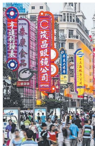
OPPORTUNITIES ABOUND: The trade delegation visited Shanghai.