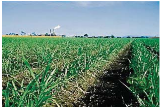
■ POTENTIAL: Productivity continues to prosper in the region.

"What's very important for Queensland is we continue to diversify our economy and in the process create jobs in regional Queensland," he said.