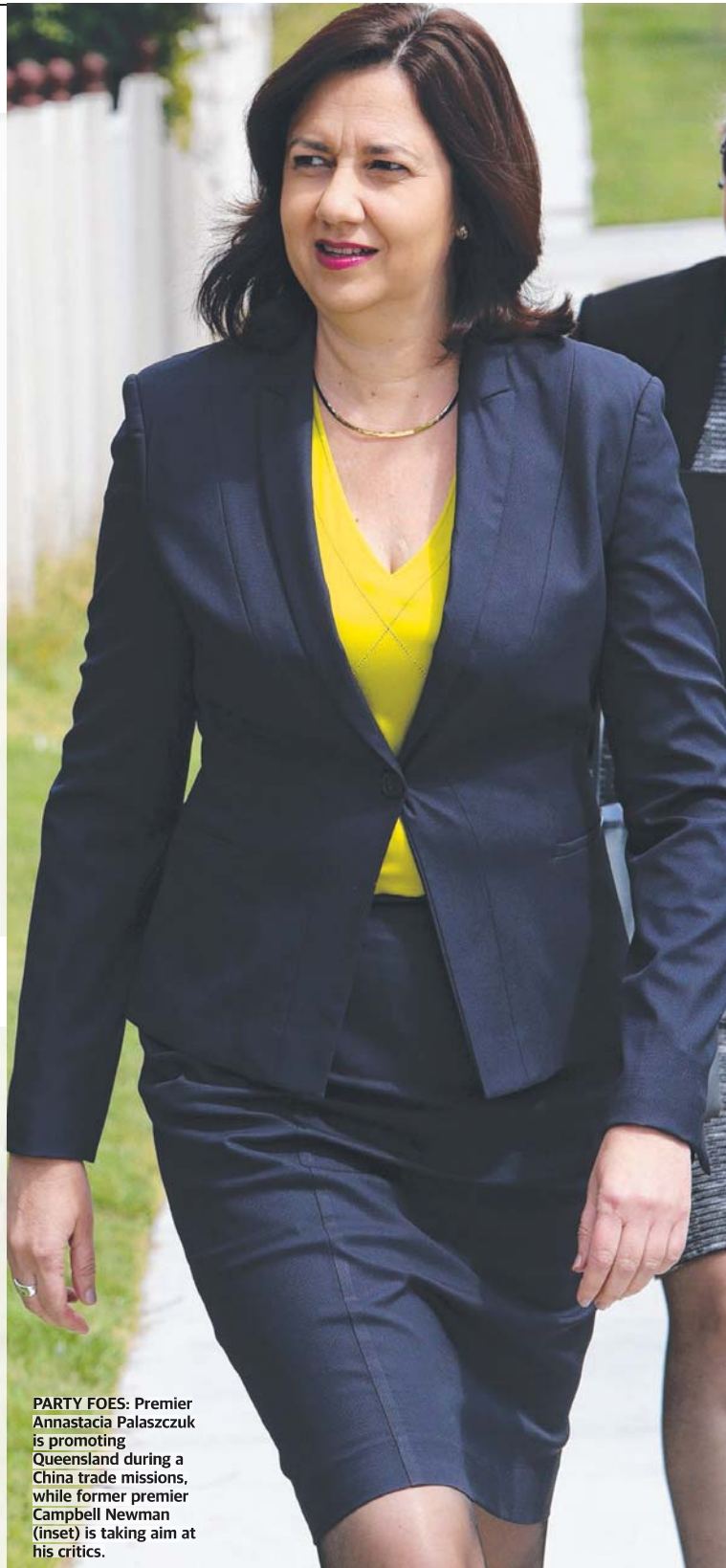
PARTY FOES: Premier Annastacia Palaszczuk is promoting Queensland during a China trade missions, while former premier Campbell Newman (inset) is taking aim at his critics.