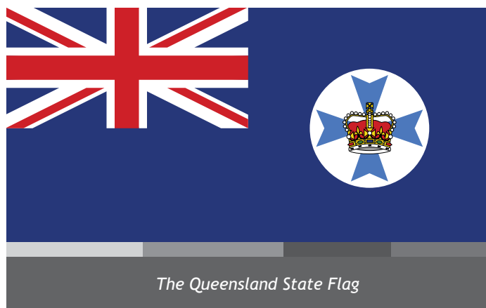
The Queensland State Flag

Adopted as part of the state flag on 29 November 1876, the state badge is officially described as "On a Roundel Argent a Maltese Cross Azure surmounted with a Royal Crown".