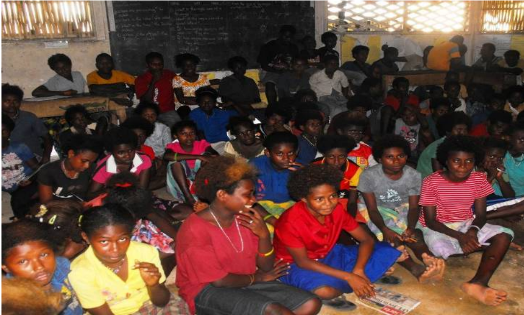
Balil Primary School Students- Nissan Island

Parliamentary Education Awareness Programme has been intensively conducted thru out South, Central and North Regions of Bougainville.