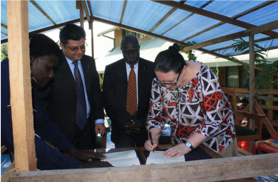
Formal signing of the Twinning Agreement between NSW Parliament and the Bougainville House of Representatives in 2010.

The annual APEC hosted by the NSW Parliament in 2010 and the Queensland Parliament this year is an opportunity for the BHOR Education Section to learn from and share some useful tips that will help in some ways to develop our small jurisdiction and our people in light of the implementation of the Bougainville Peace Agreement.