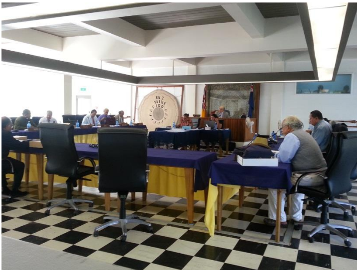
Above: Speaker and members of parliament undertaking

The Standing Orders of the Niue Legislative Assembly make provision for Select Committees and how their order of business is to be conducted.