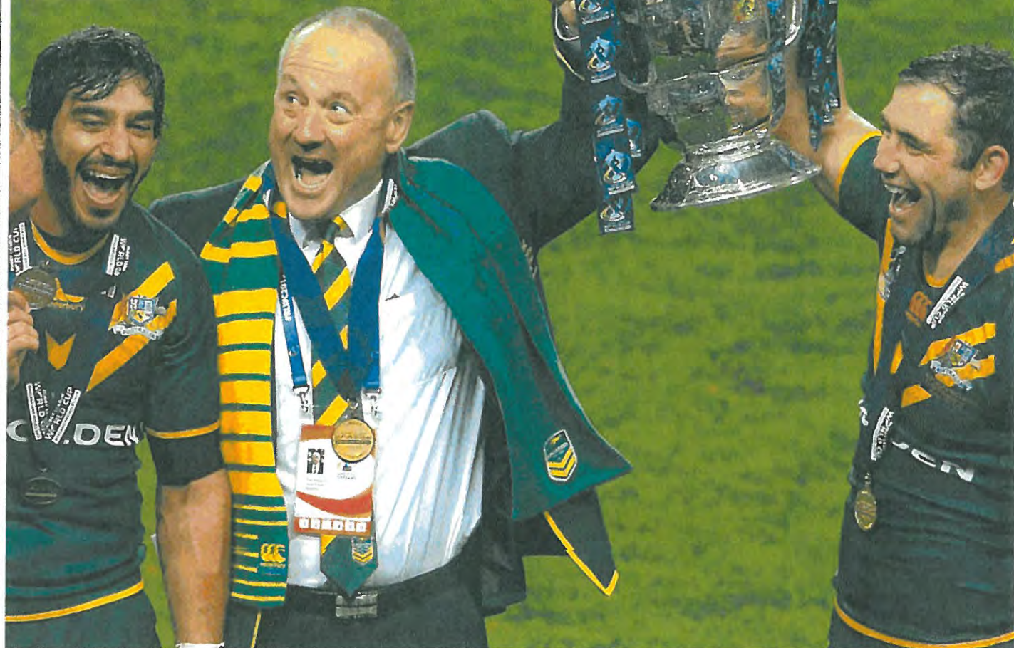
TROPHY WORTH GRABBING: Australia's World Cup heroes Johnathan Thurston and Cam Smith celebrate victory with coach Tim Sheens.