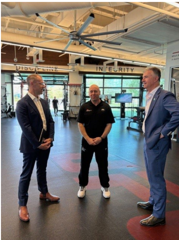
Meeting with UFC Leadership and tour of the UFC Performance Institute