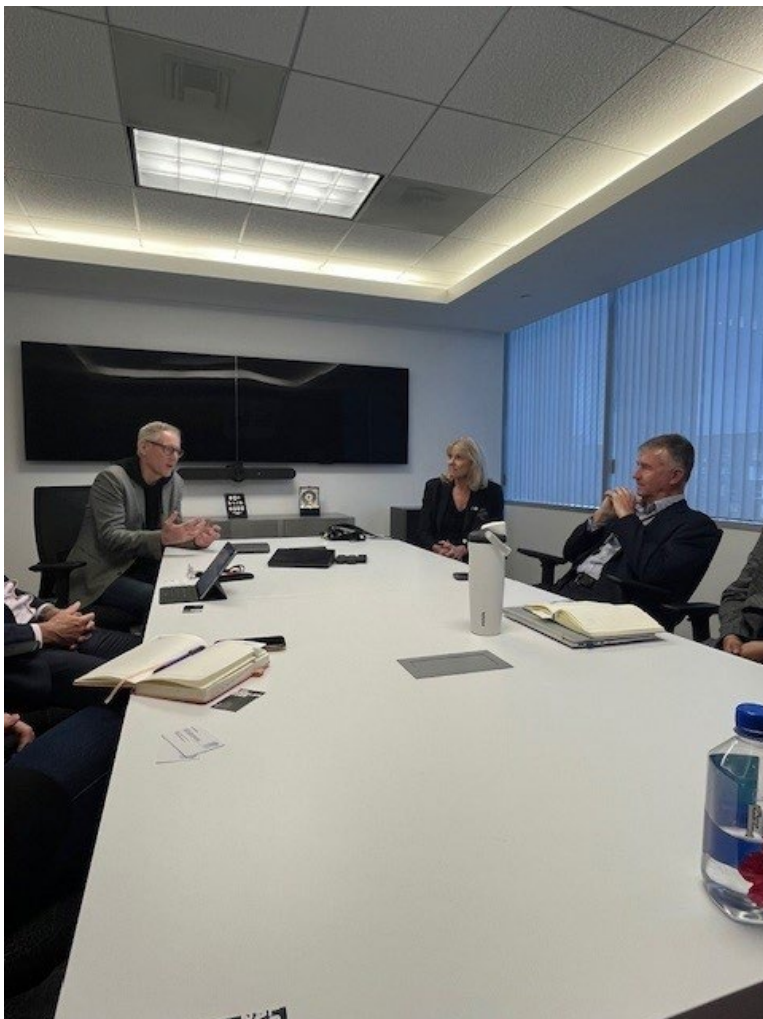
Meeting with LA 2028 Organizing Committee