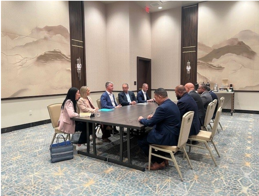
Meeting with the Deputy Prime Minister of Papua New Guinea