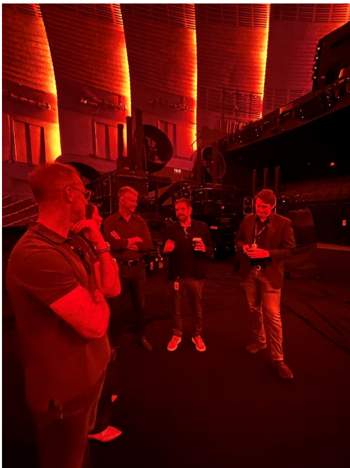
Tour of and experience at Sphere