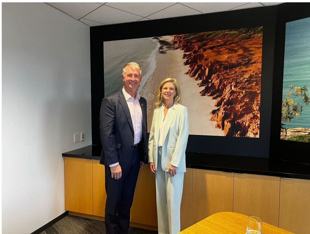
Briefing with the Australian Consul-General, LA