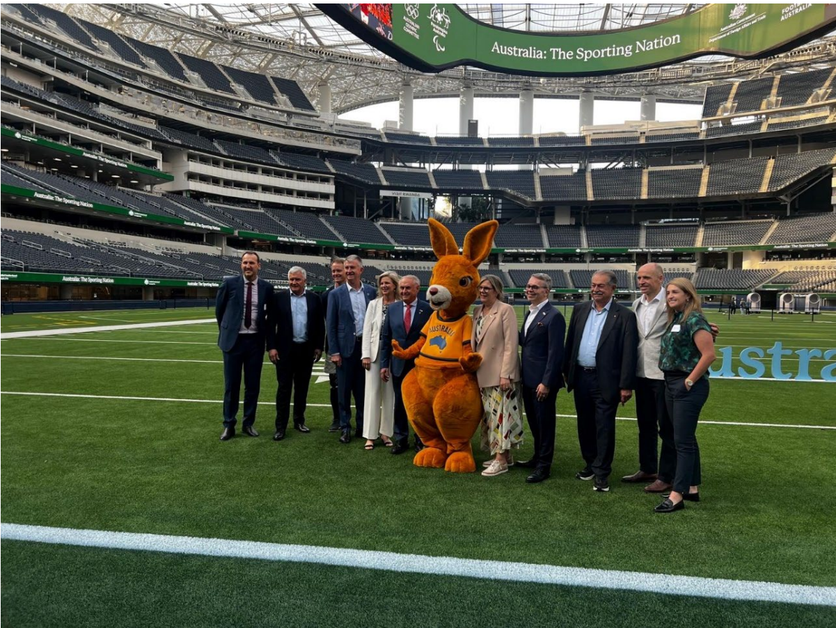
Australia the Sporting Nation