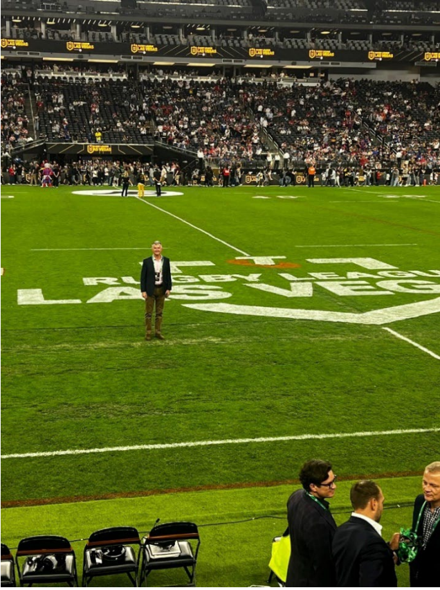
Tour of Allegiant Stadium