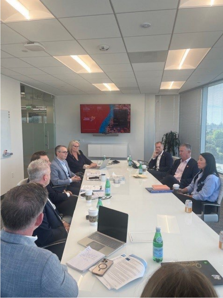
Meeting with Tourism Australia and Qantas