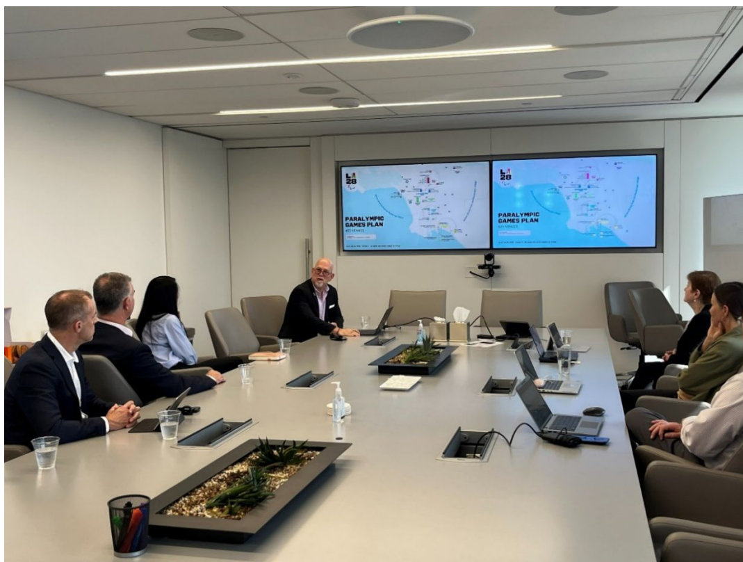
Meeting with AECOM