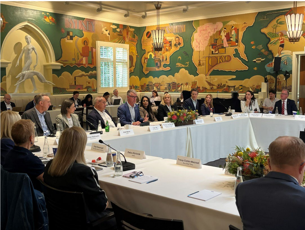
G'Day Business Roundtable