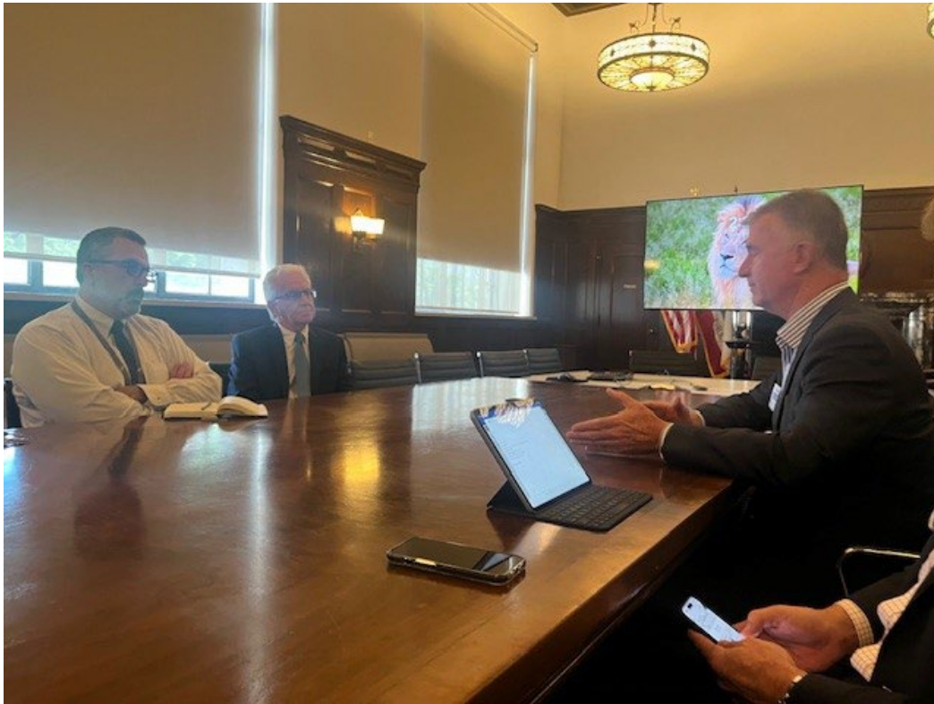
Meeting with LA Mayor's Office of Major Events