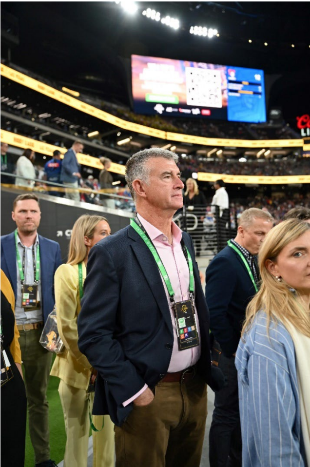
National Rugby League 2026 Season Las Vegas Launch