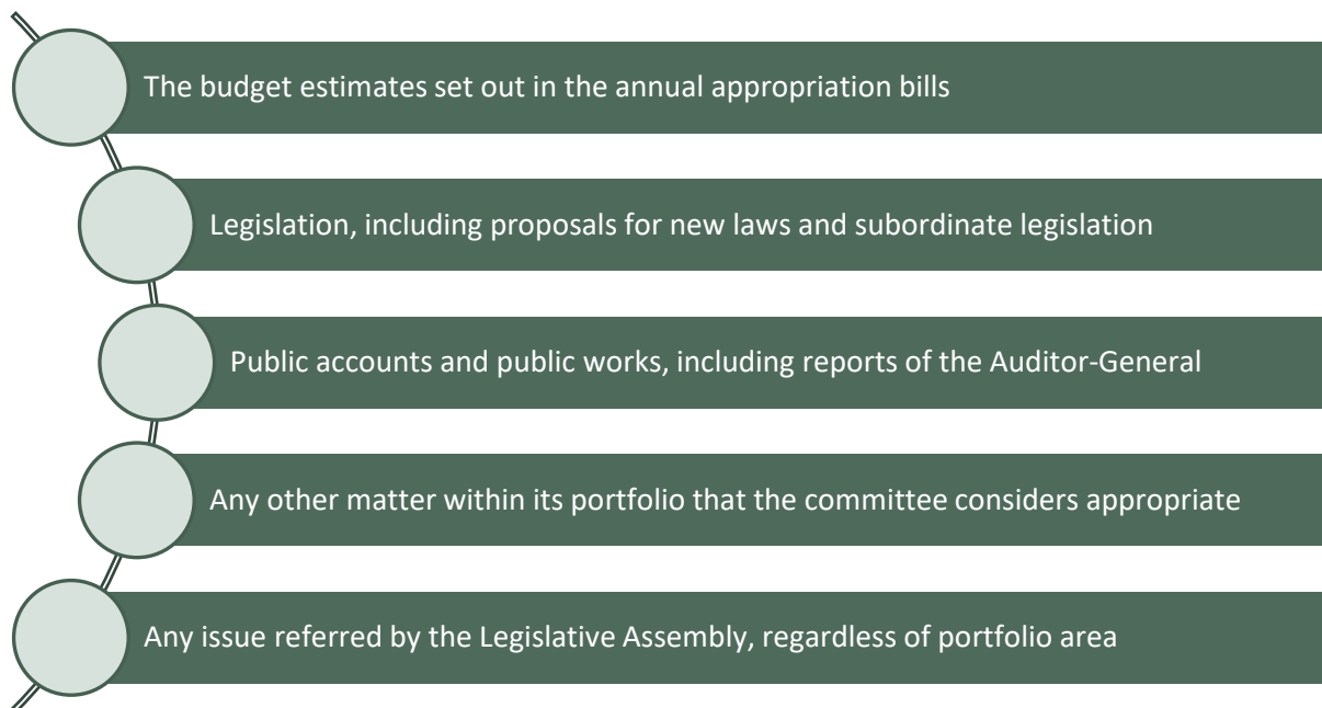
Figure 1: Committees are responsible for oversight of many matters within their portfolio areas

The committee has a broad range of responsibilities within its portfolio area detailed in Figure 1 below. These responsibilities are set out in the Parliament of Queensland Act 2001 . 10