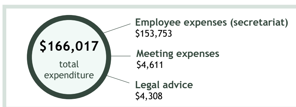
Figure 2: Main areas of committee expenditure from 13 February 2024 to 30 June 2024

After employee expenses, meeting expenses, which primarily comprised catering expenses, were the most notable area of expenditure for the committee.