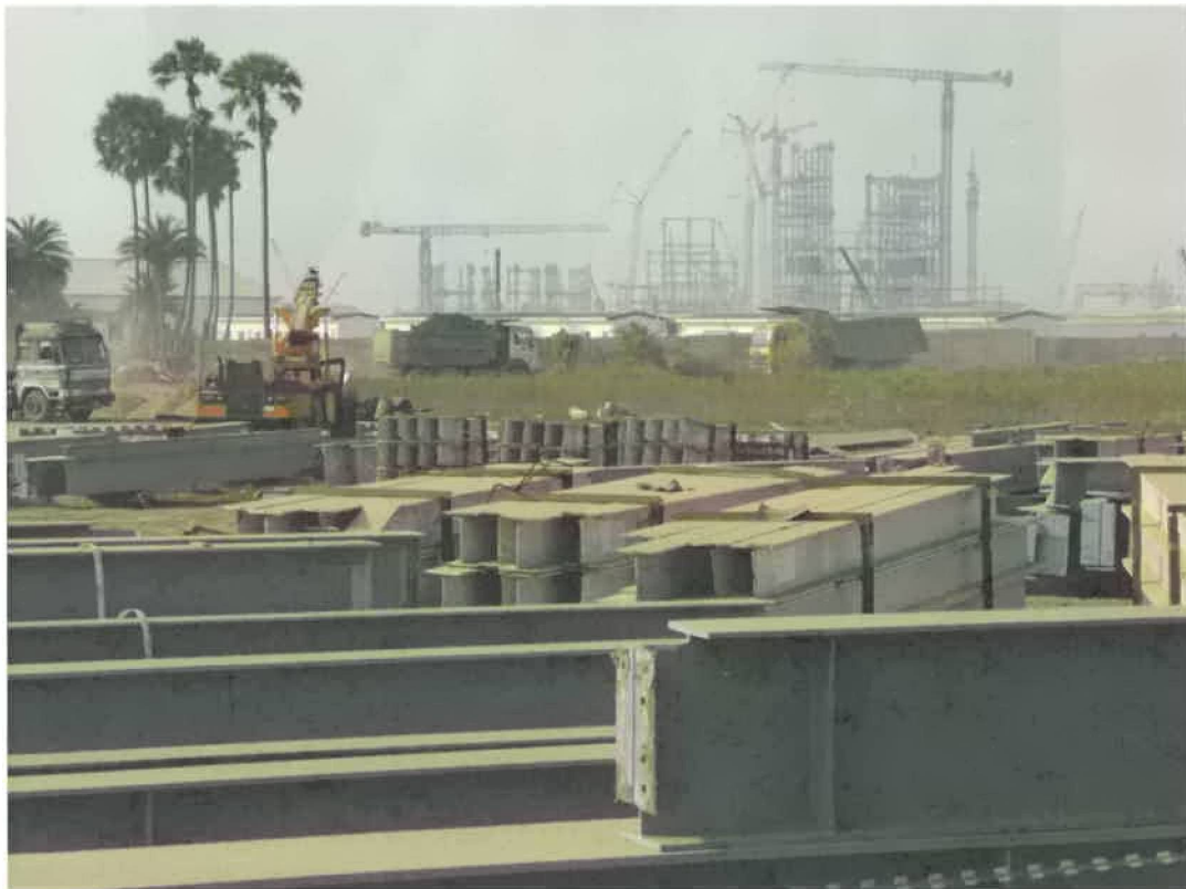
Construction of Adani's Godda power station proceeds on lands acquired from indigenous farmers near Godda. February 2020

AdaniWatch stories – March 2020 , April 2020 and July 2020 .