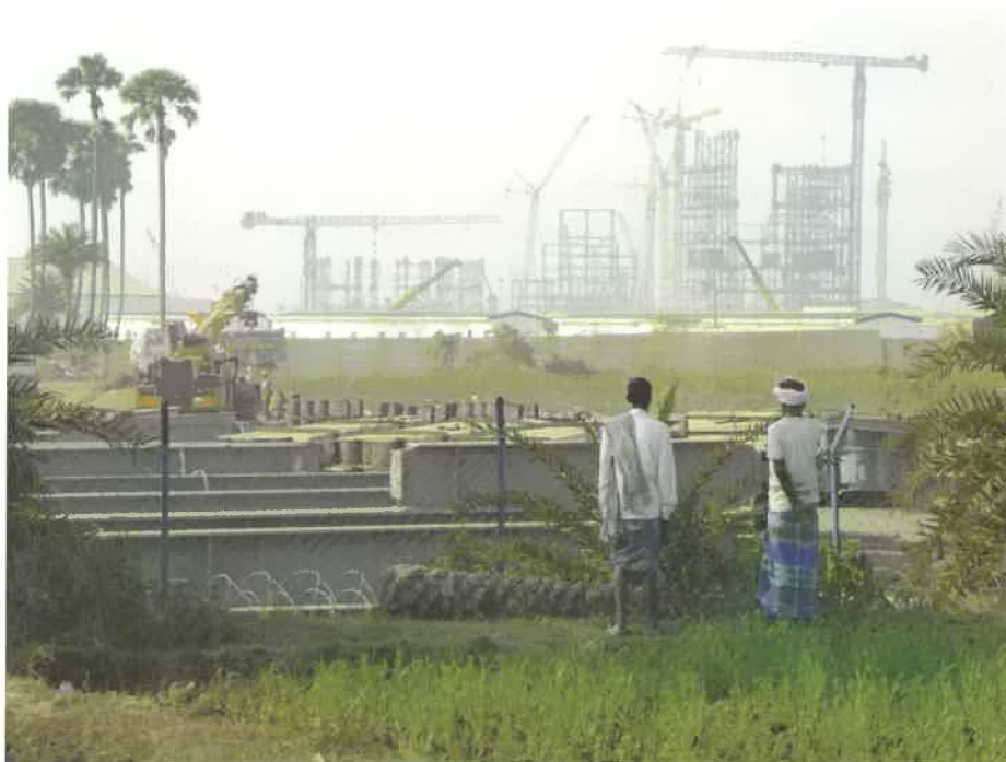
Construction of Adani's Godda power station proceeds on lands forcibly acquired by government from indigenous (Adivasi) farmers near Godda. Two Adivasi look on.