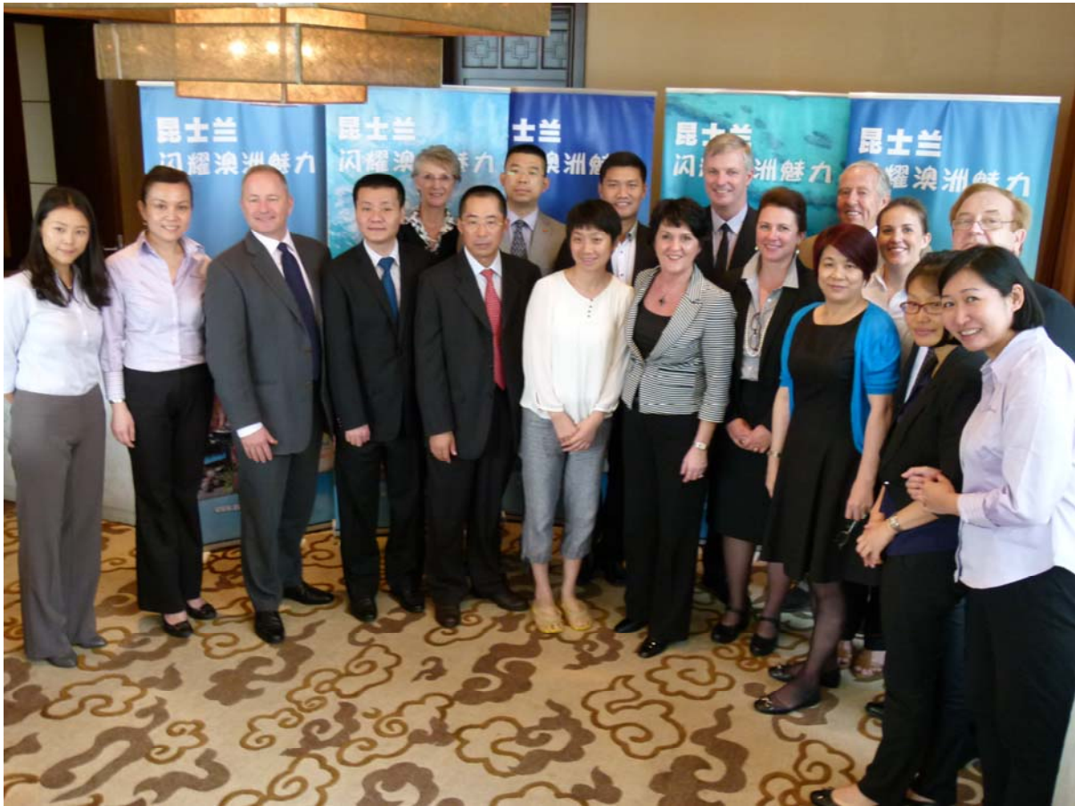
Meeting with Southern China Wholesalers