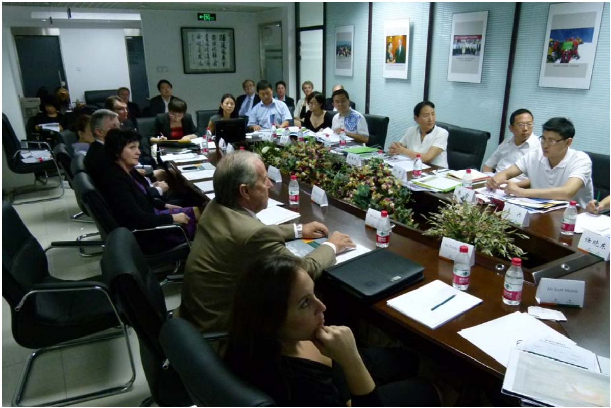
Meeting with CRECC