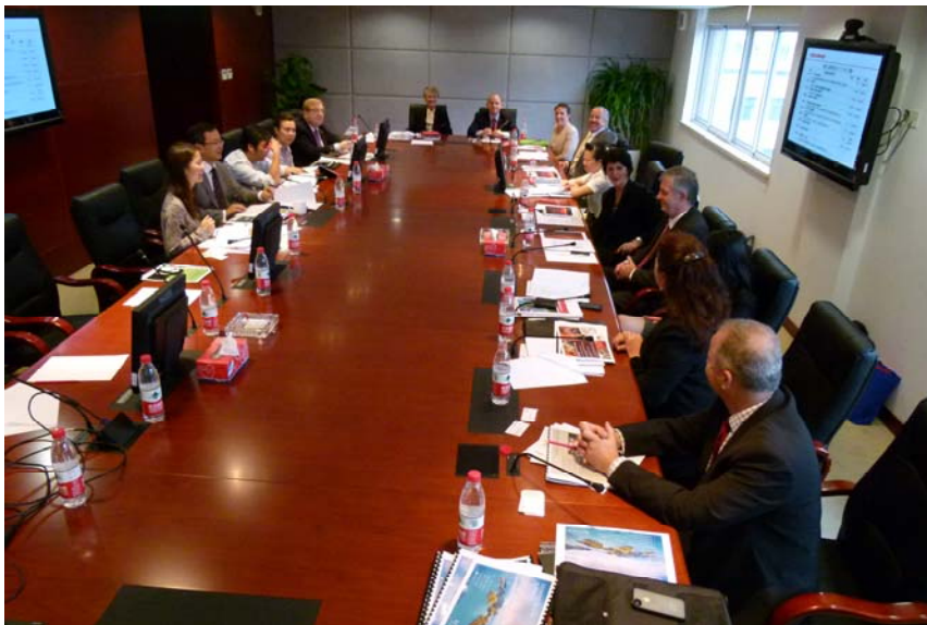
Meeting with CRIC