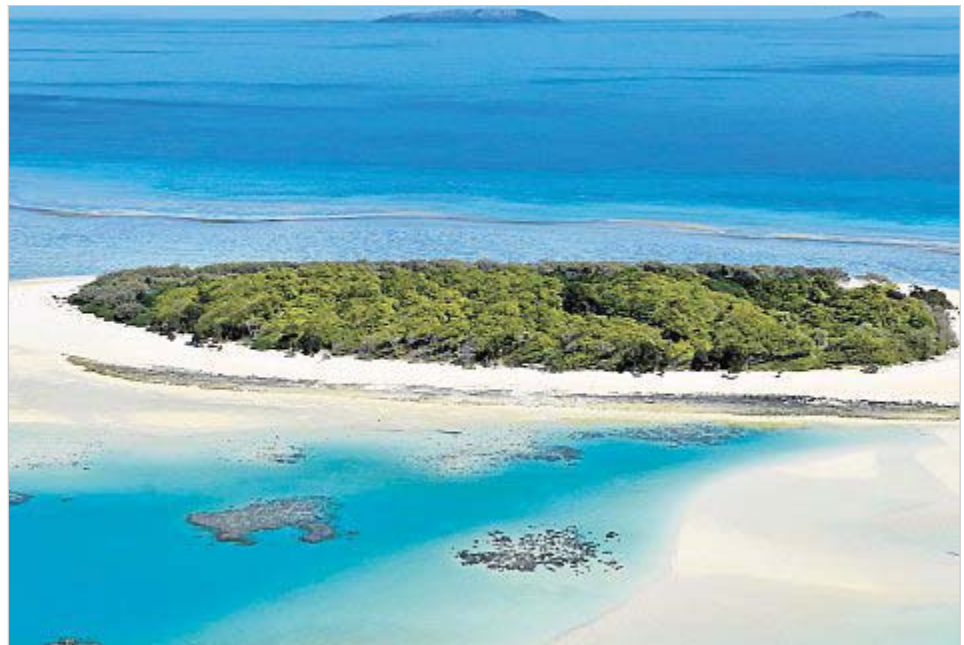
FUNDING MADE: Bushy Atoll- Great Barrier Reef.

“Now, for the first time ever, Queenslanders and people from across the globe will be able to see changes in the conditions on the reef in real-time.