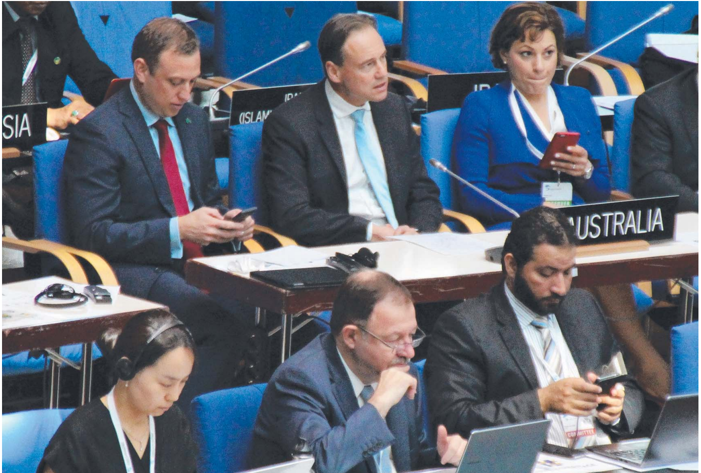
REEF VICTORY: Federal Environment Minister Greg Hunt with Queensland deputy premier Jackie Trad in the UNESCO chamber.