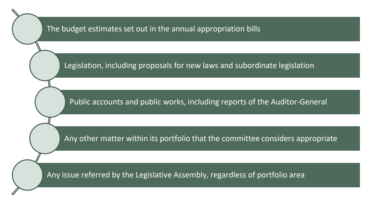
Figure 1: Committees are responsible for oversight of many matters within their portfolio areas

The committee has a broad range of responsibilities within its portfolio area, as detailed in Figure 1, below. These responsibilities are set out in the Parliament of Queensland Act 2001 .9