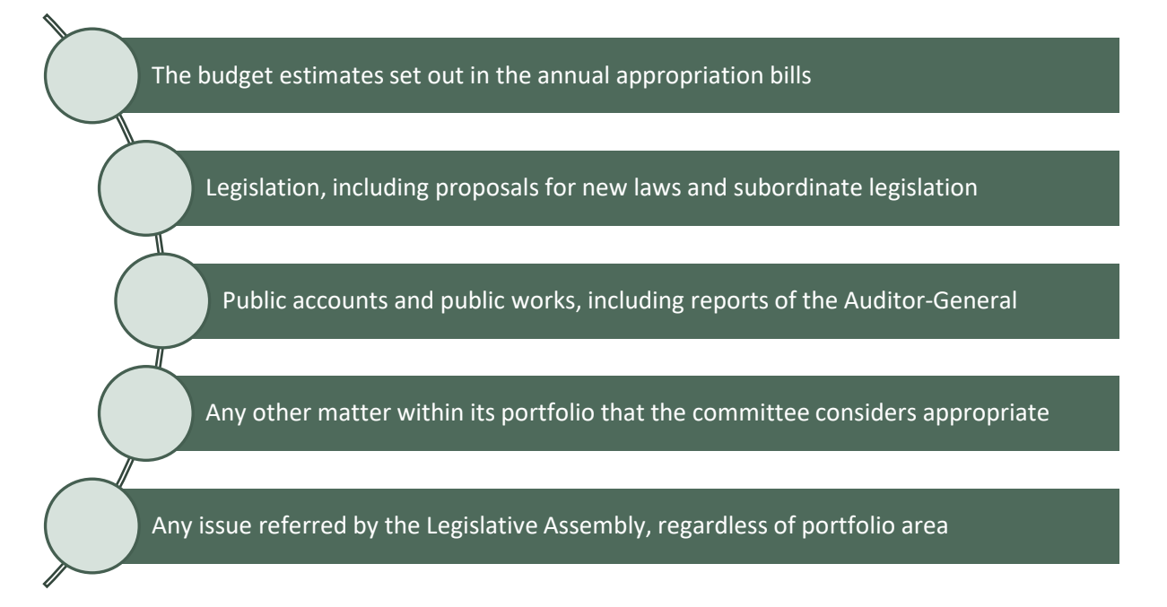
Figure 1: Committees are responsible for oversight of many matters within their portfolio areas

The committee has a broad range of responsibilities within its portfolio area, as detailed in Figure 1, below. These responsibilities are set out in the Parliament of Queensland Act 2001 (PoQA).<sup>4</sup> The committee is also responsible for oversight of the Family Responsibilities Commission (FRC), as detailed in Schedule 6 of the Standing Rules and Orders of the Legislative Assembly.