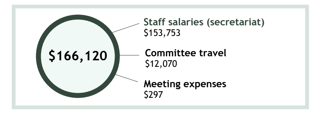
Figure 2: Main areas of committee expenditure, February to June 2024

Figure 2 below shows the three main areas of expenditure. As that figure illustrates, salaries for the secretariat staff that support the committee comprised the vast majority (just over 90 per cent) of the committee's expenditure. The committee's secretariat is a three-person team, supplemented with additional resources from across the Committee Office as needed throughout the year. After staffing expenses, committee travel was the most notable area of expenditure for the committee.