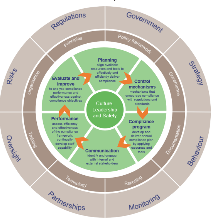
Figure 1C Natural resources compliance framework