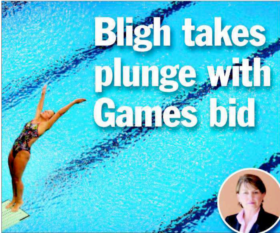
Determined: Queensland Premier Anna Bligh (inset) will go to Malaysia in May to lodge Queensland's bid for the 2018 Commonwealth Games.

Cairns Post 08-Apr-2011 Page: 11 General News Market: Cairns QLD Circulation: 24053 Type: Regional Size: 355.03 sq.cms Frequency: MTWTF--