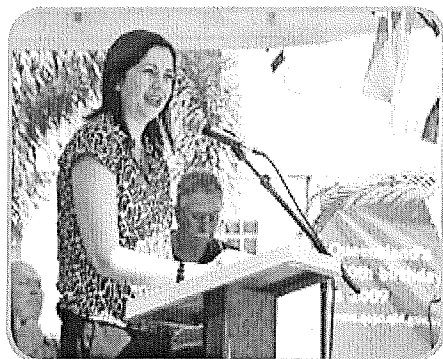
Minister for Multicultural Affairs Anastacia Palaszczuk opens the Bundaberg Multicultural Festival organised by the Bundaberg Sunrise Rotary Club.