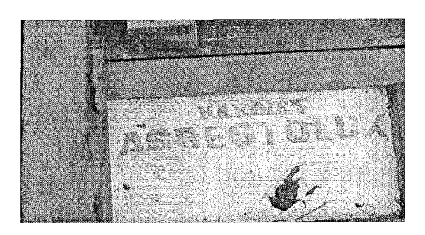
Photograph 1: Asbestolux

Low density asbestos fibre board is a lightly compressed board which looks similar to asbestos cement sheeting or plaster board. It is also sometimes referred to as asbestos insulating board. Generally, low density asbestos fibre board was manufactured as a flat sheet product although some perforated sheeting typically used for acoustic ceiling applications was also manufactured. The most common example of low density asbestos fibre board is 'Asbestolux', a product formerly manufactured by James Hardie Pty Ltd.