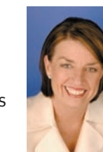
Anna Bligh MP Premier and Minister for the Arts

Queensland's prosperity and growth is built on the strength of our regions. This document puts on record the Government's commitment to the people and economy of the Darling Downs and West Moreton region.