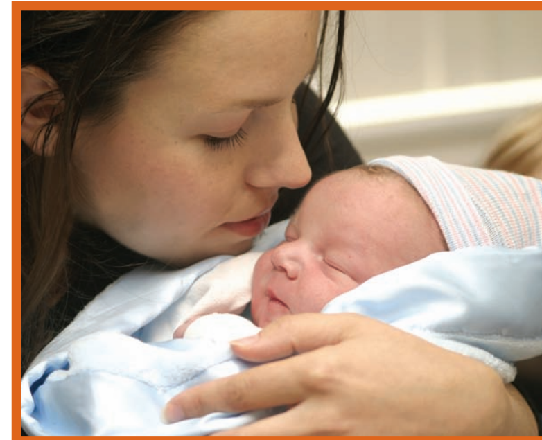
Toowoomba Birthing Centre The Queensland Government is committed to making Queenslanders Australia's healthiest people by investing in healthcare, health services and hospitals. In 2009-10, the Government will invest $1 million to develop a birthing centre at the Toowoomba Hospital.

The Queensland Government is committed to the fight against climate change and